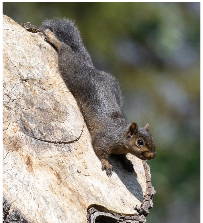
Black squirrel in Mill Road garden