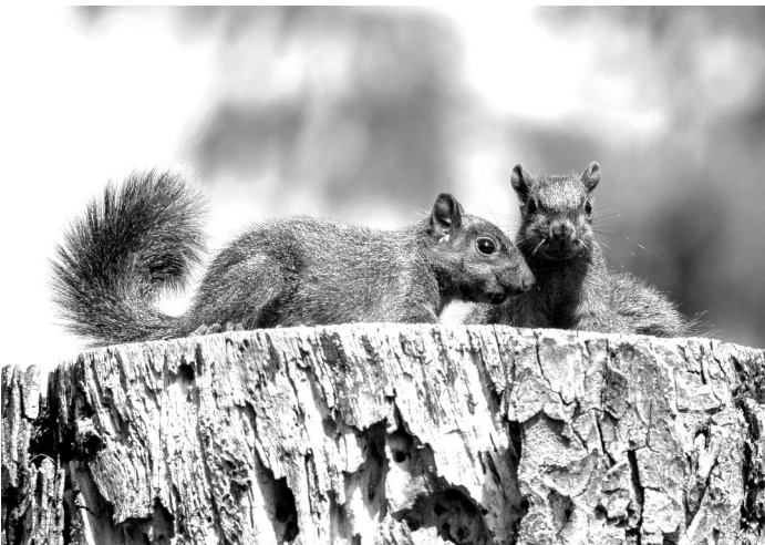
Twin black squirrel babies

So, who are they and where do they come from? I am no wildlife expert, so I turned to Google. Apparently the first sighting of a black squirrel in the UK was in 1912 in either Hertfordshire or Bedfordshire, depending on which article you read. It is thought that the current population is probably descended from escapees from a menagerie of exotic animals. They then spread north and east. In 2010, they were believed to make up 50% of the squirrel population in areas around Cambridge and have now spread further.